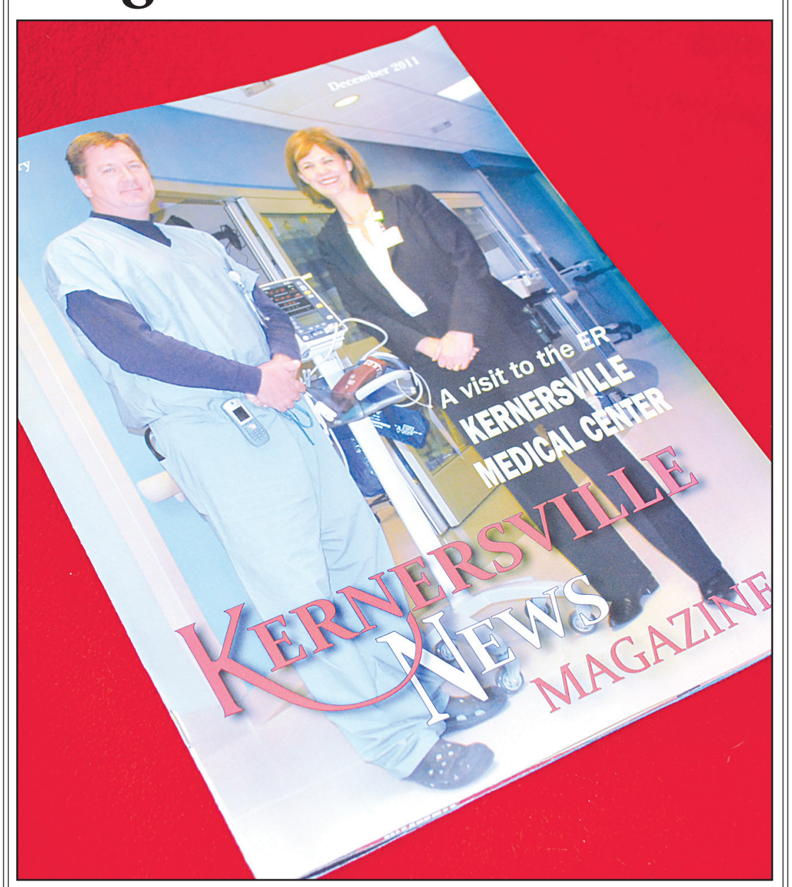
The inaugural edition of Kernersville News Magazine hit the stands Friday and is available at a variety of locations around town.